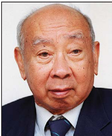
Dr Goh Keng Swee

Former Deputy Prime Minister and Singapore's economic architect Goh Keng Swee died on May 14, 2010 at the age of 91.